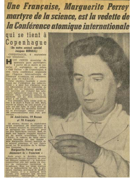
Figure 4. "A French woman, Marguerite Perrey [sic], a martyr of science is the star of the International Atomic Conference held in Copenhagen."