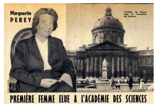
Figure 9. Marguerite Perey next to the building of the Institut de France, Quai Conti, Paris.