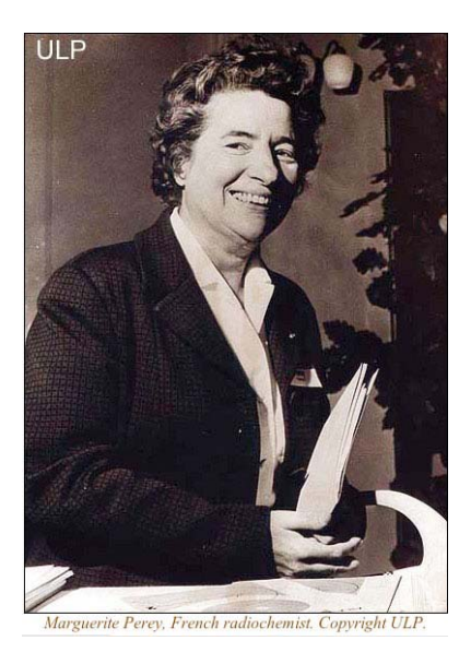
Figure 1. Marguerite Perey (1909–1975) in 1960.