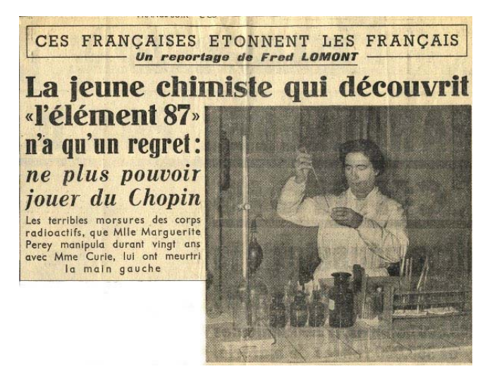
Figure 3. "The young chemist who discovered element 87 has one sole regret: never again being able to play Chopin. The dreadful bitings of radioactive substances handled during 20 years with Marie Curie have injured her left hand." ( France Soir , December, 1950).