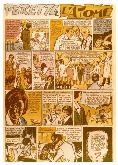
Figure 10. "Perette et l'Atome," 2<sup>nd</sup> installment, Fripounet et Marisette , December 7, 1961.