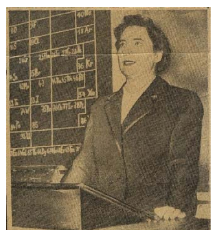
Figure 2. Inaugural Lecture of Marguerite Perey in the Auditorium of the Institut de Chimie, Université Strasbourg, November 8, 1949. A specially drawn periodic chart emphasized the positions of francium and other radioelements.

interested only a handful of physicists and chemists or occasionally lecturers, who reported a few lines from scientific papers in national newspapers.